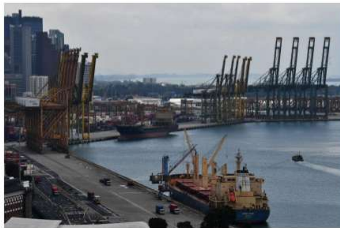
Bilateral trade between Singapore and the EU has held steady over 2020.

Singapore, EU ink agreements to drive collaboration, business activities