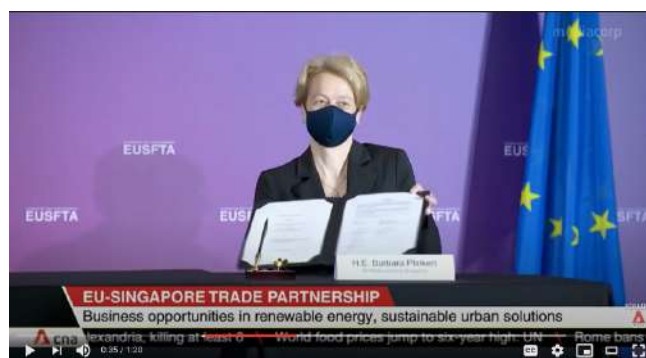
Singapore, EU mark first anniversary of free trade agreement