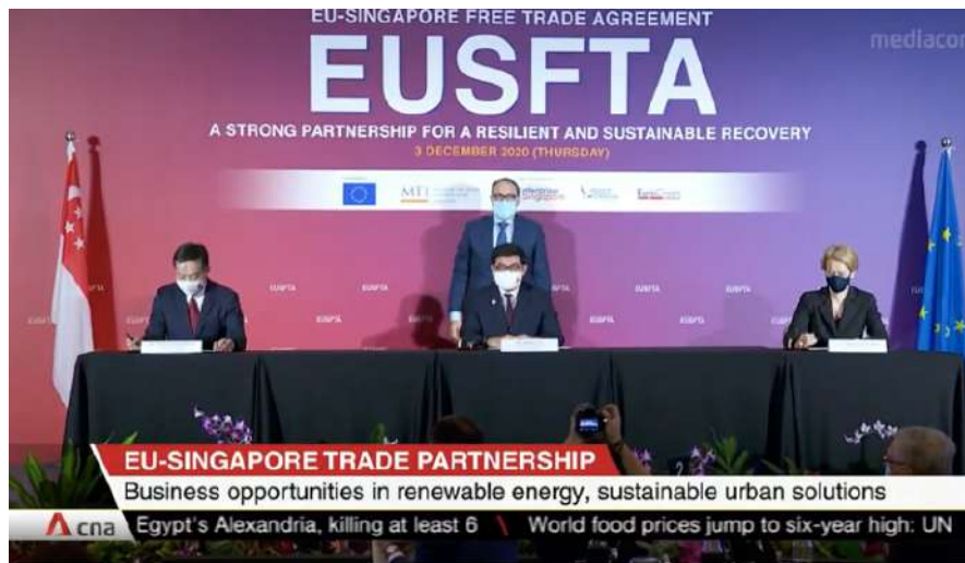
Singapore, EU mark first anniversary of free trade agreement

Channel NewsAsia is the leading television network in Singapore and South-East Asia, bringing the most comprehensive daily news coverage of Asia.