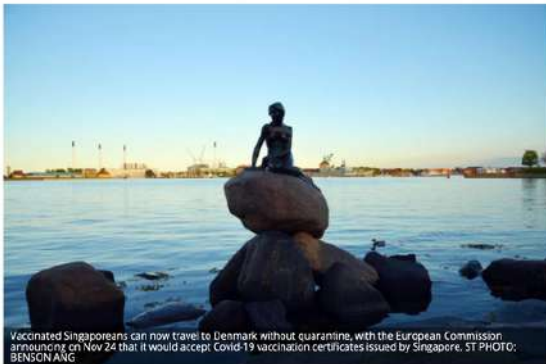
Vaccinated Singaporeans can now travel to Denmark without quarantine, with the European Commission announcing on Wednesday (Nov 24) that it would accept Covid-19 vaccination certificates issued by Singapore.

VACCINATED Singaporeans can now travel to Denmark without quarantine, with the European Commission announcing on Wednesday (Nov 24) that it would accept Covid-19 vaccination certificates issued by Singapore from Thursday.