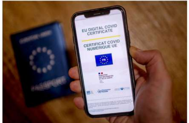
The European Commission announced that Covid-19 certificates issued by Singapore are now recognised as the equivalent of the EU's Digital Covid Certificate.