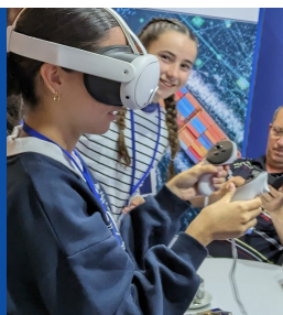
EU supports fisheries, tourism, and maritime industries towards sustainability