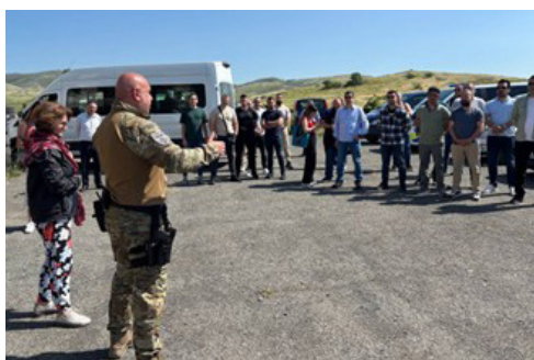
EU invests in stronger law enforcement for effective migration management