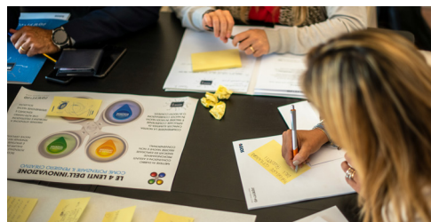
EU fosters skills for green jobs in the Mediterranean