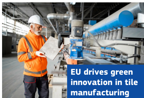
EU drives green innovation in tile manufacturing