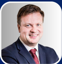
Mr Ville Skinnari Member of the Finnish Parliament, Chairman of GCC parliamentary friendship group and former Minister of Trade of the Republic of Finland