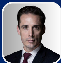
Mr Jean-Baptiste Djebbari Former Minister for Transport in France, Managing Partner at Magellim Infrastructure