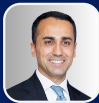
H.E. Mr Luigi Di Maio EU Special Representative for the Gulf