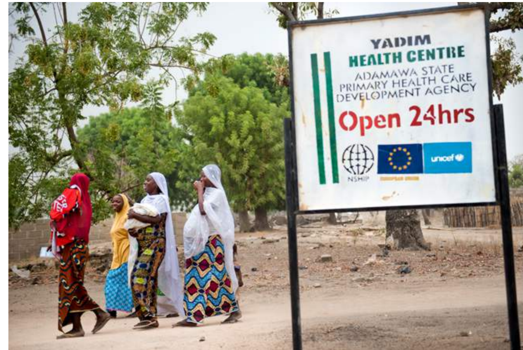
Delivering maternal health services to hard to reach communities

At Yadim Primary Health Care Center located in a remote village in Adamawa State, nursing mothers and pregnant women troop in daily either to receive vaccines for their babies or to receive maternal medical consultation. The Centre is funded by the European Union under the EU Support to scale-up Maternal and Newborn Child Health Outcomes in Northern Nigeria (EU-MNCH).