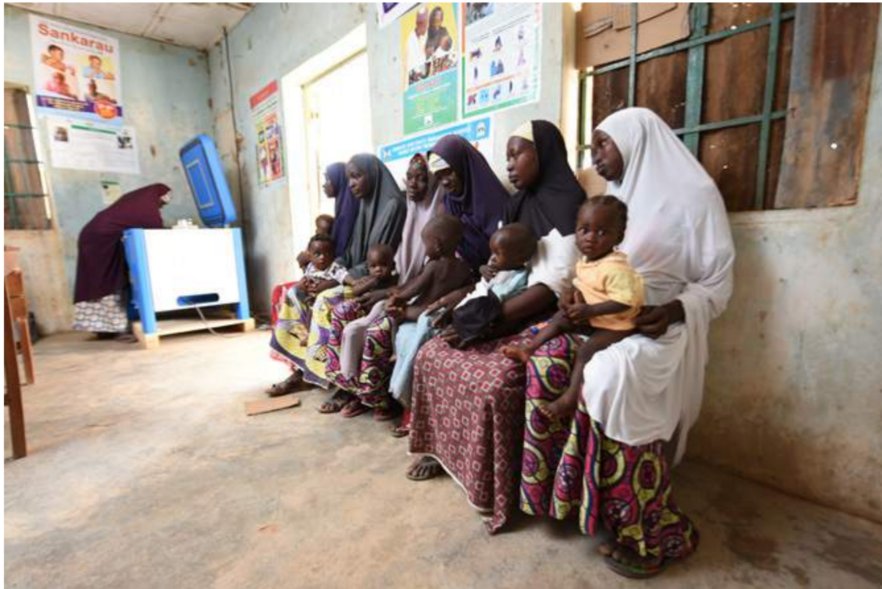
Mothers wait in line for their children to be immunized at Bardoki community in Gummi LGA, Zamfara State.