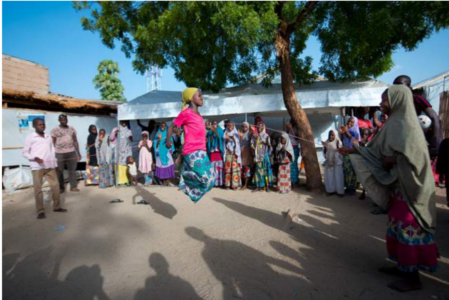
Building child-friendly spaces.

Studies show that exercise has helped cure or reduce the negative effects of children's mental disorders such as stress, depression, and attention deficit hyperactivity disorder.