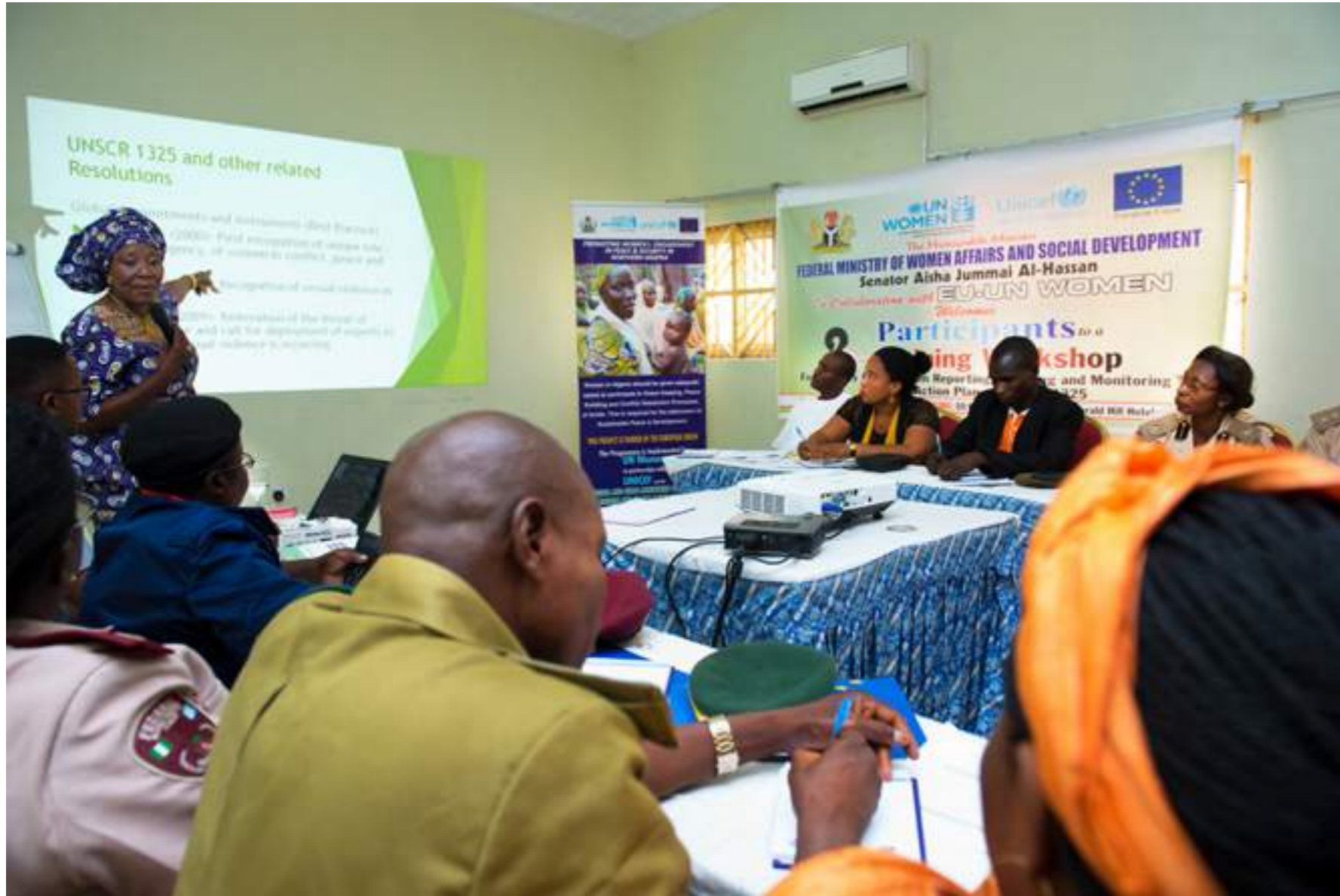
© EU Delegation Nigeria. Photo by Ochi Samuel, 2017.