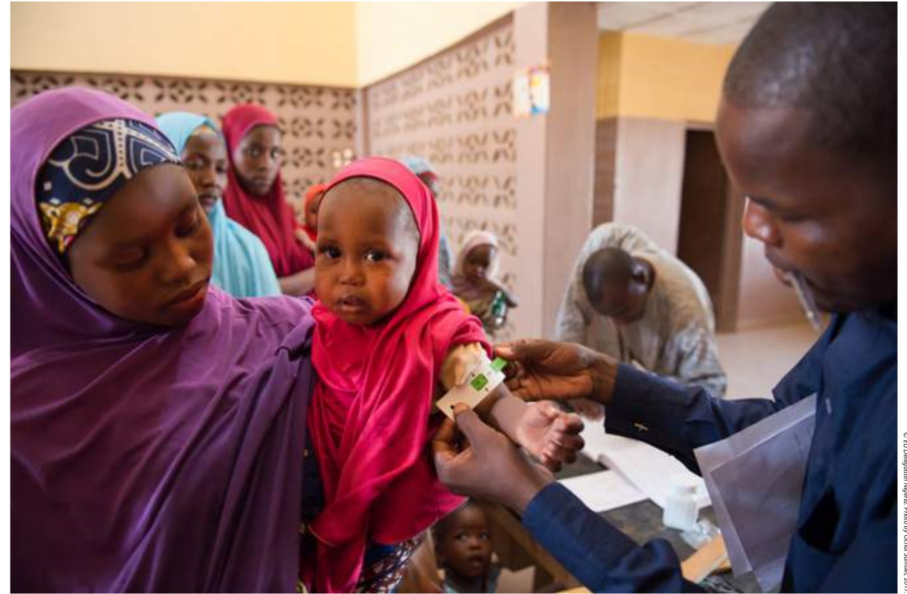
© EU Delegation Nigeria. Photo by Ochi Samuel, 2017.