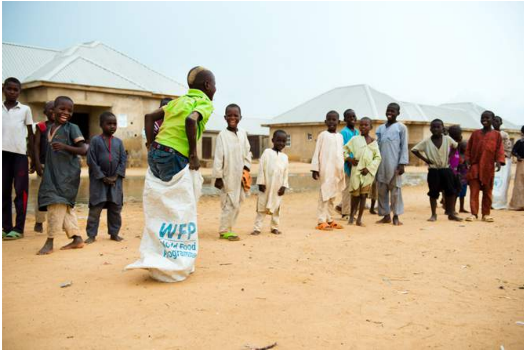
Play and Learn session day in one of the IDPs camps in Borno State, Maiduguri.