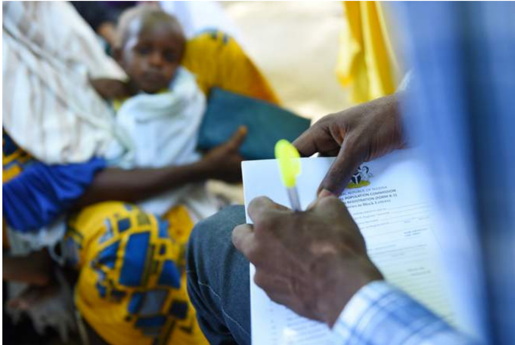
We encourage childbirth registration

An EU-SIGN trained health worker documents the details of a child during a birth registration exercise in Nayinawa community PHC, Damaturu LGA, Yobe state.