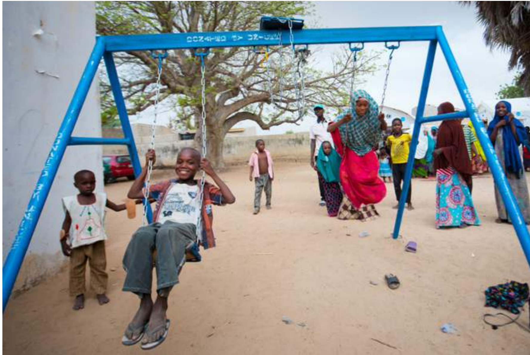
Building child-friendly spaces.