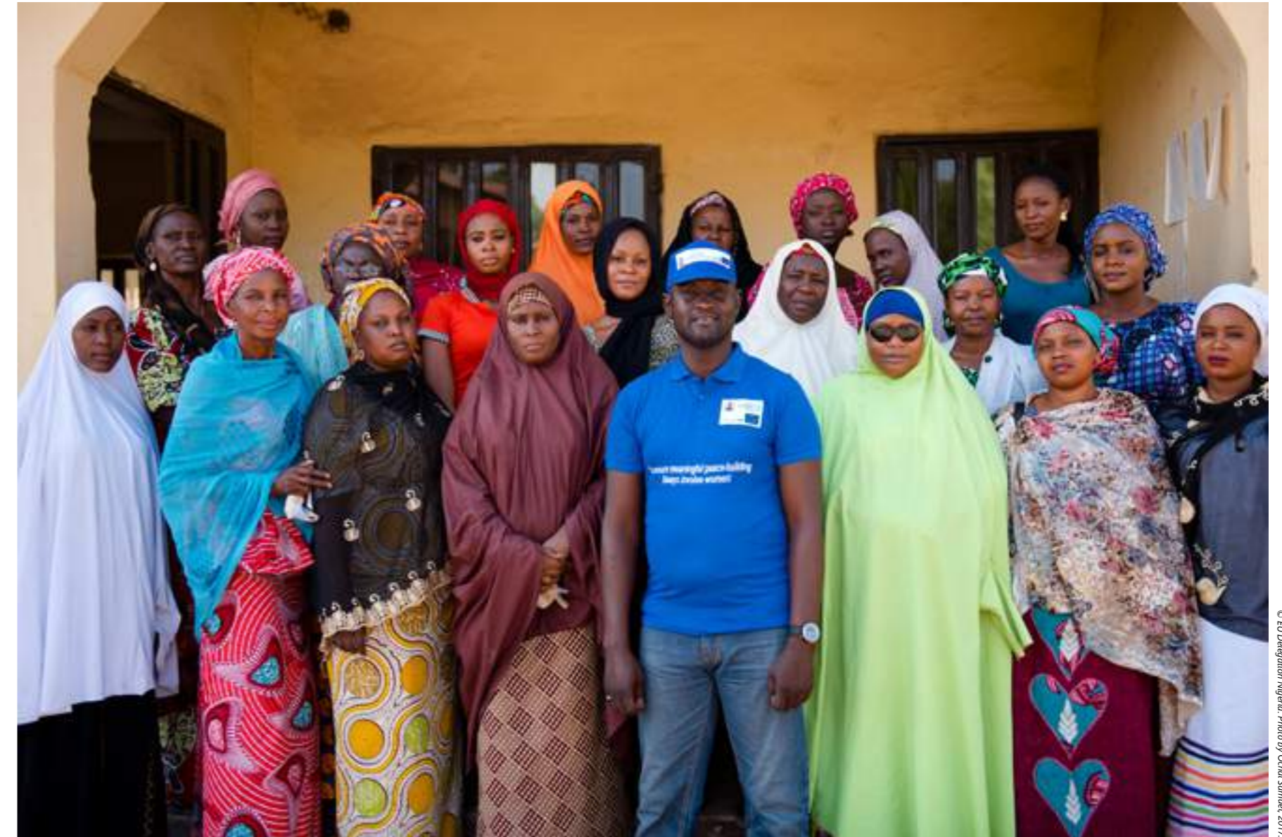
© EU Delegation Nigeria. Photo by Ochi Samuel, 2017.