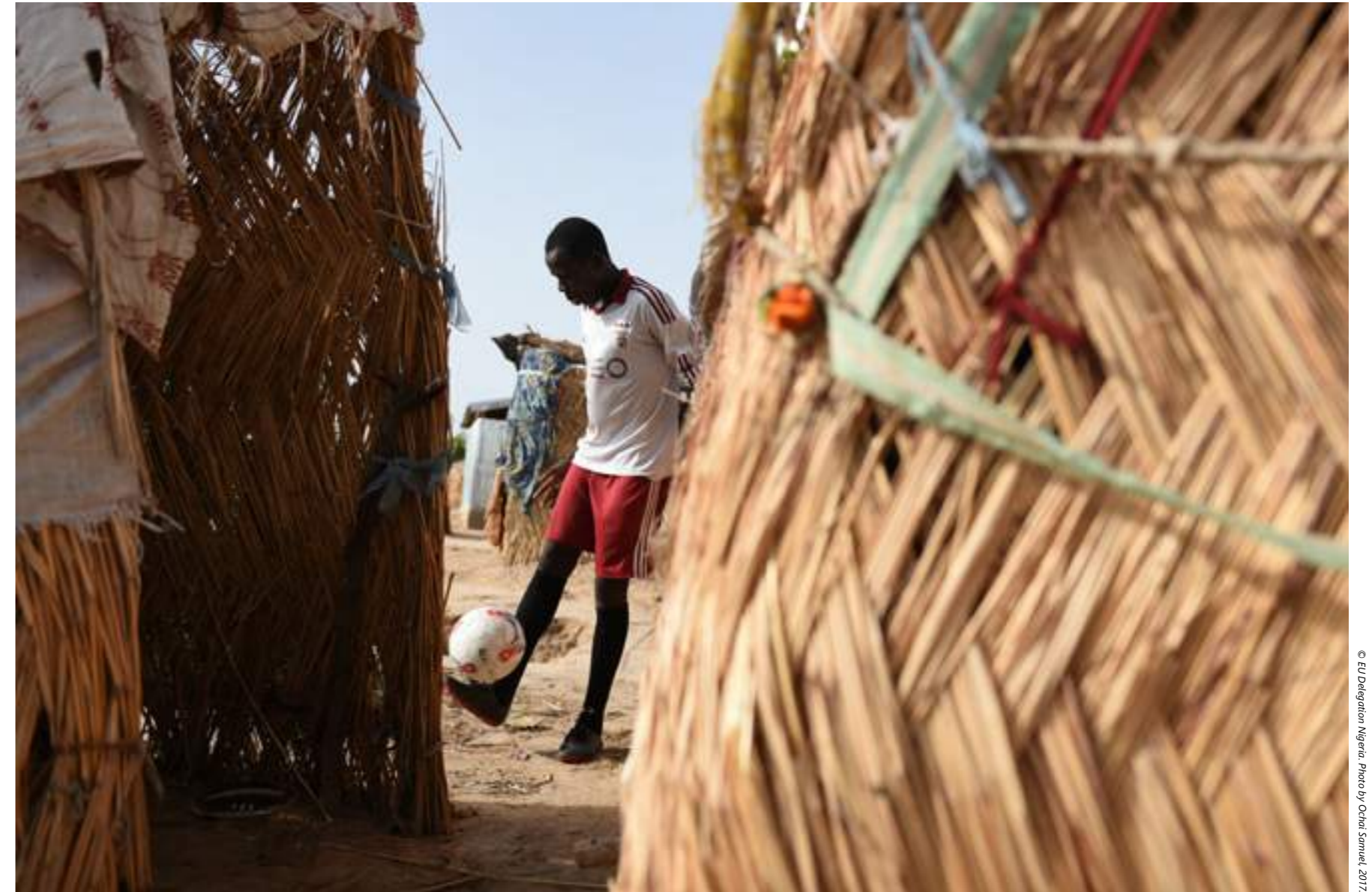
Life goes on, so must I.