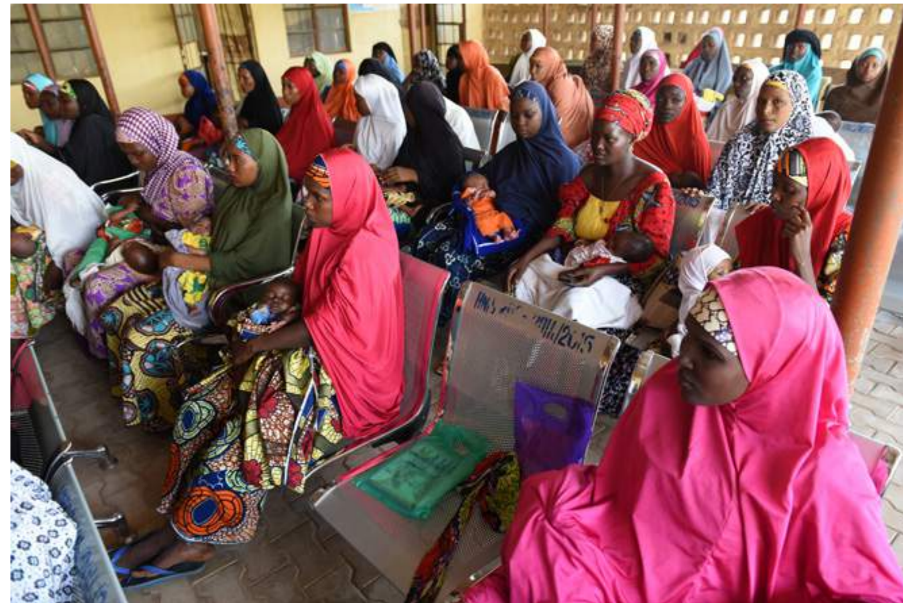
Mothers wait in line for their child to be immunized at Akko community PHC facility in Akko LGA, Gombe State.