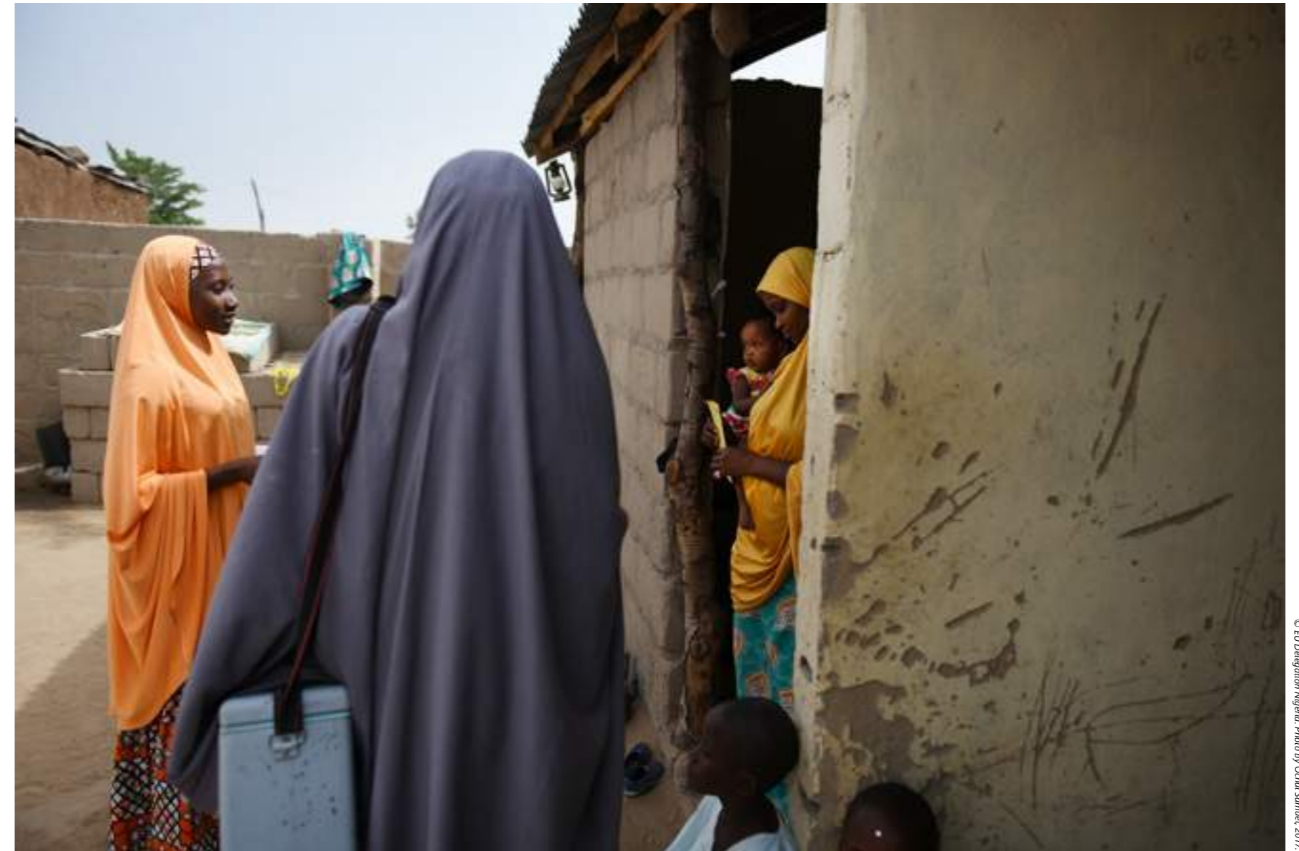
An EU-SIGN trained health worker immunizes a child at Akko LGA Gombe State against vaccine preventable diseases during a House-to-House Routine Oral Polio immunization exercise.

© EU Delegation Nigeria, Photo by Ochi Samuel, 2017.