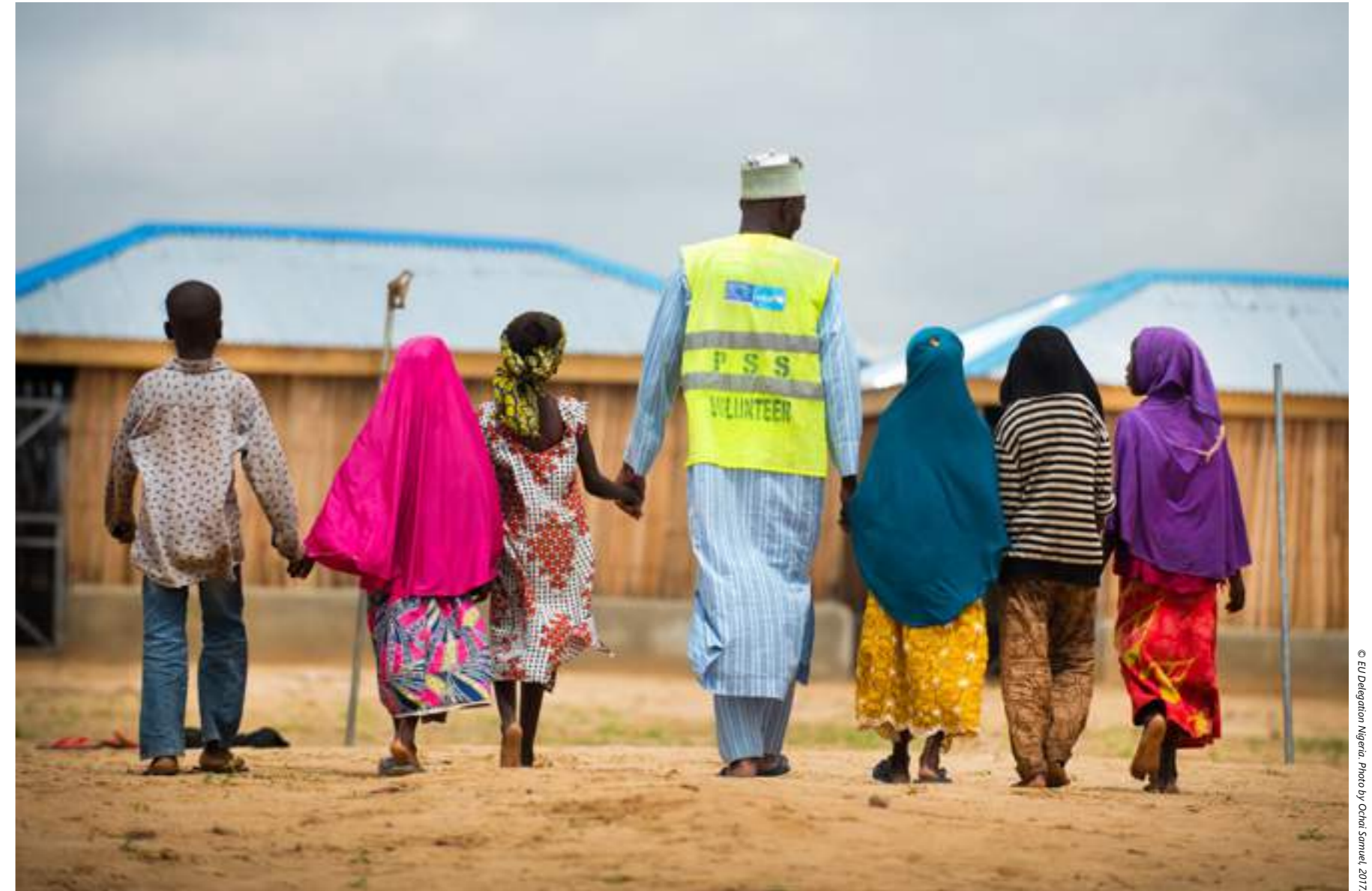
Walking away from a painful past.