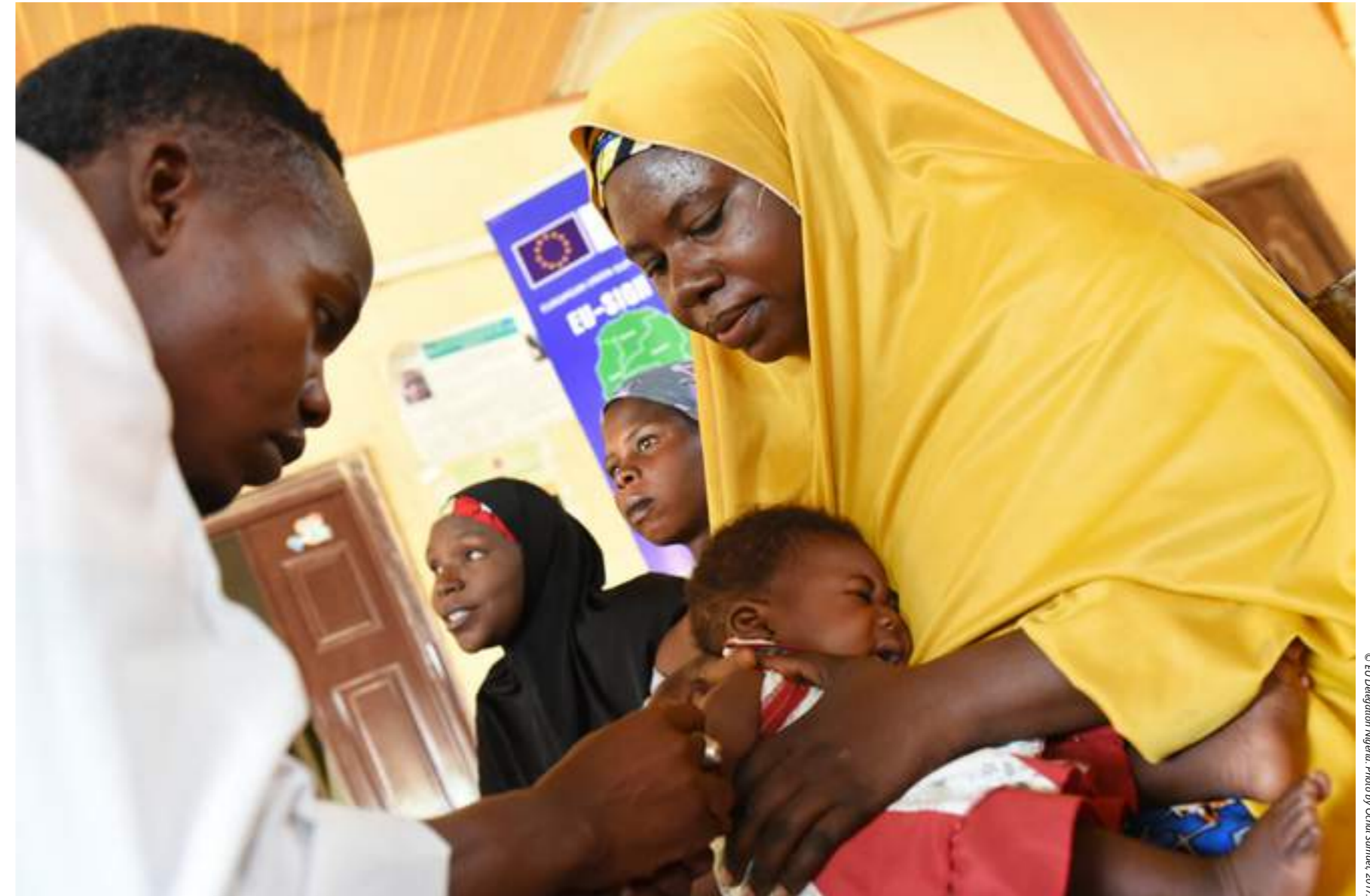
One moment of pain, a lifetime of gain.