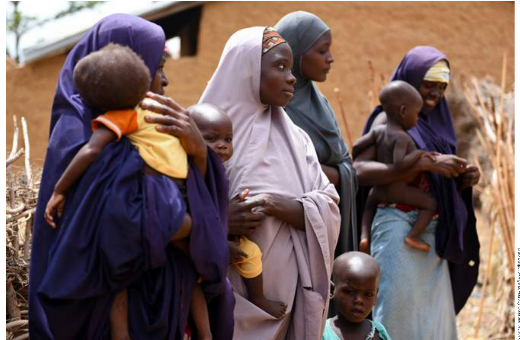
At Nafada LGA, Gombe State, EU-SIGN trained health workers carry out a house-to-house routine oral polio immunization exercise.

2017.