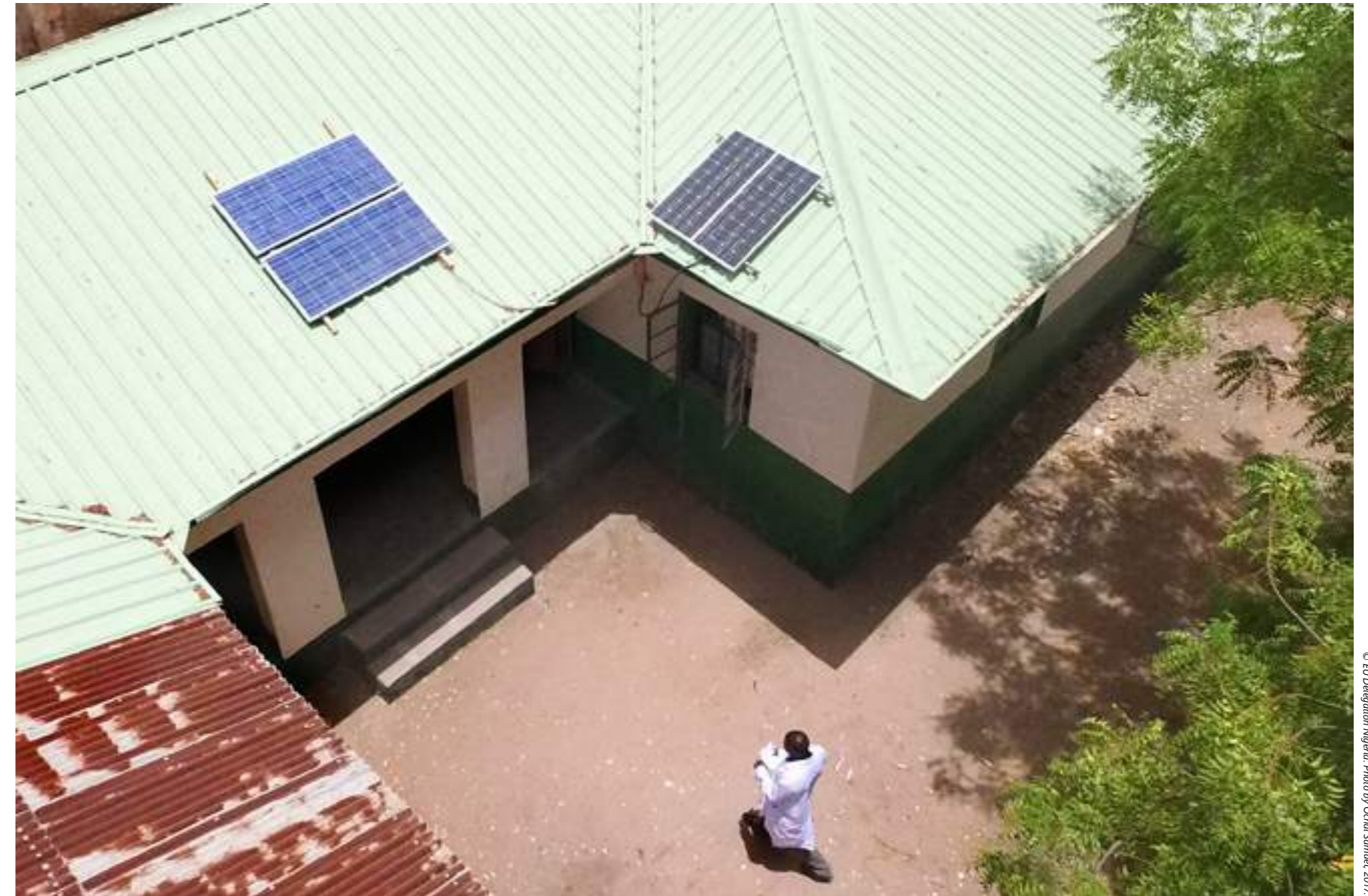
The EU-SIGN project funded the repairs of the battery and solar panel charge controllers at this cold store for storage of vaccines in Akko Local Government Area, Gombe State.