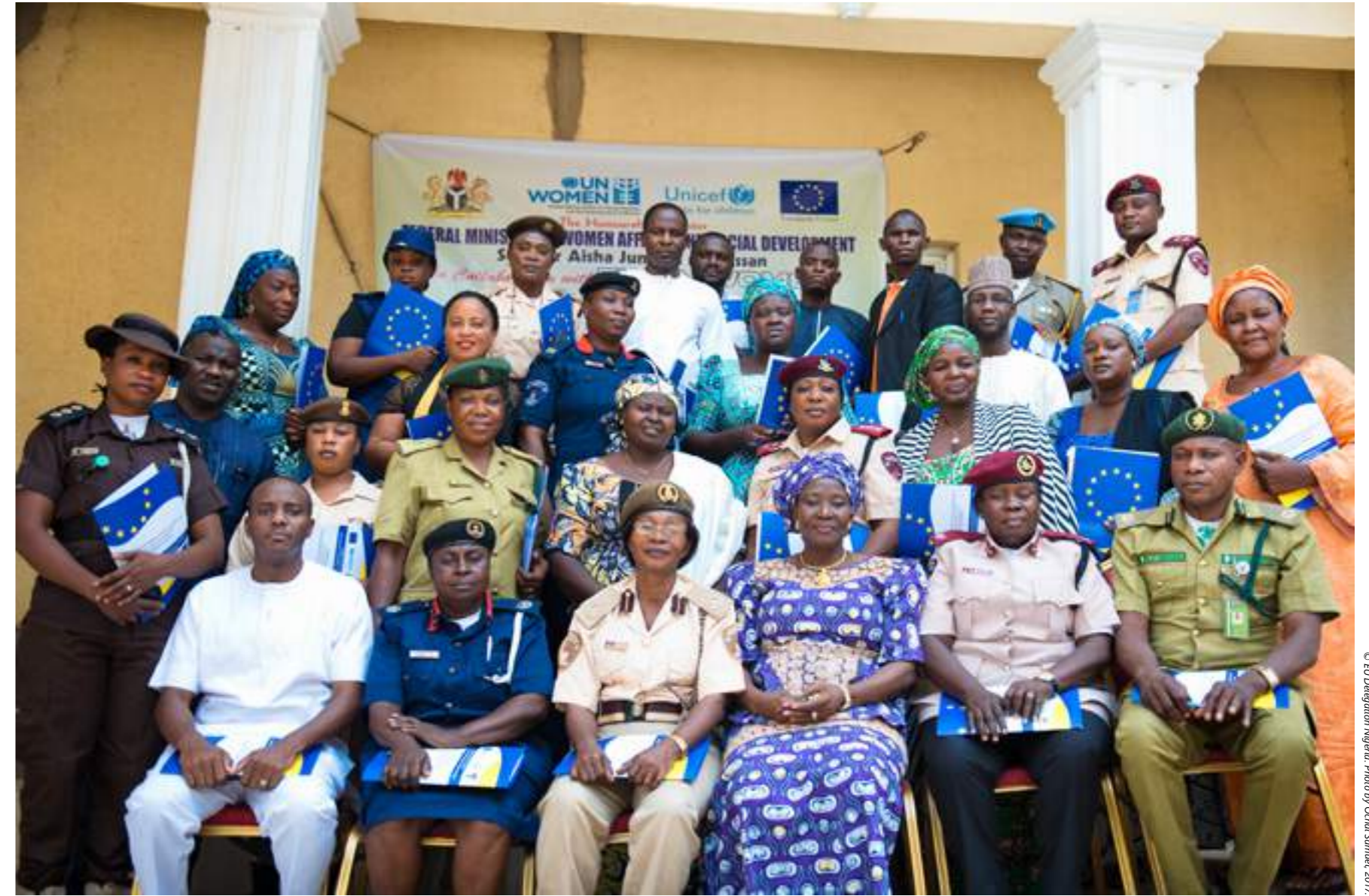
Together we can!