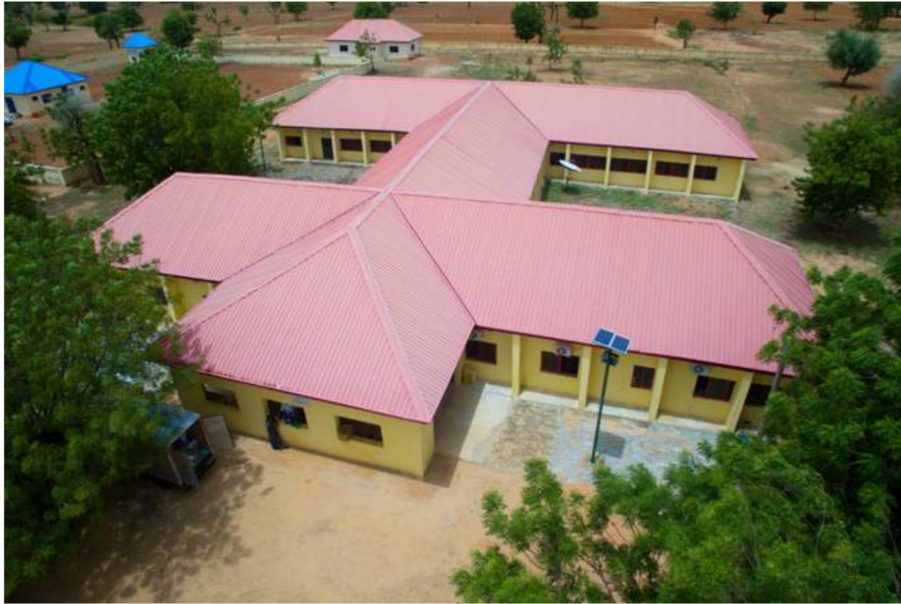
The EU-SIGN project funded the renovation of this Primary Health Care Facility in Kunchi LGA, Kano State.