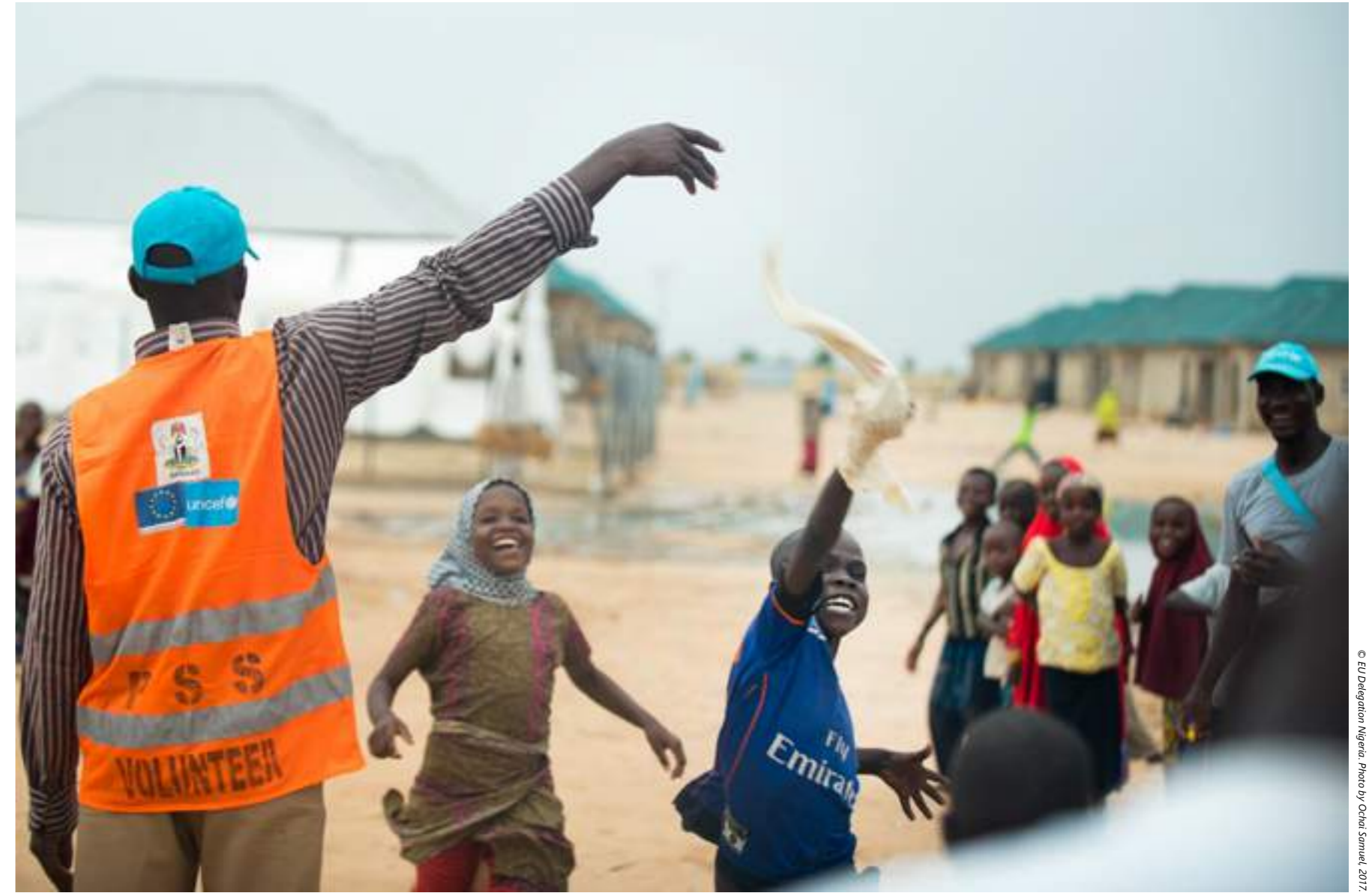
Play and Learn session day in one of the IDPs camps in Borno State, Maiduguri.

Boko Haram insurgency survivors receive psychosocial support under the EU Strengthening Community-Based Psychosocial Support and Protection Services for Children and Adolescents in Maiduguri, Borno State.