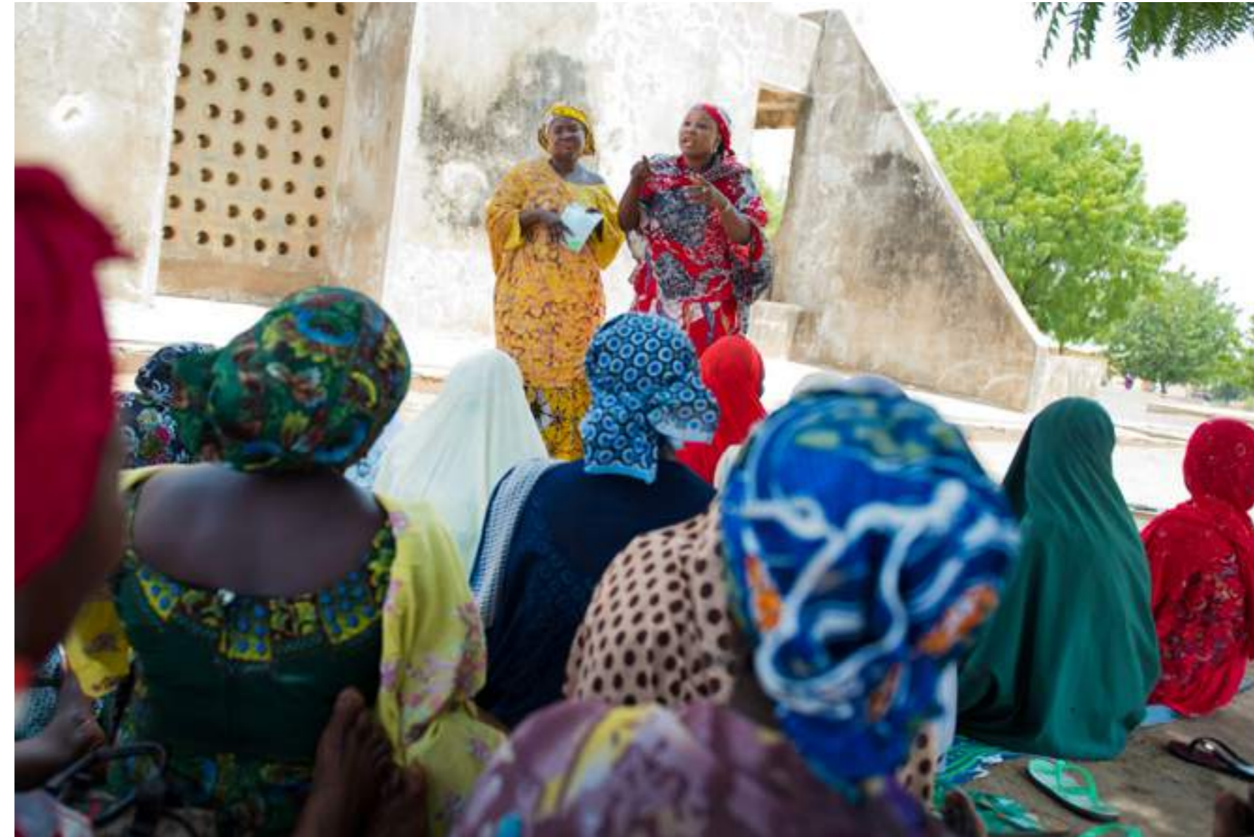
© EU Delegation Nigeria, Photo by Ochi Samuel, 2017.