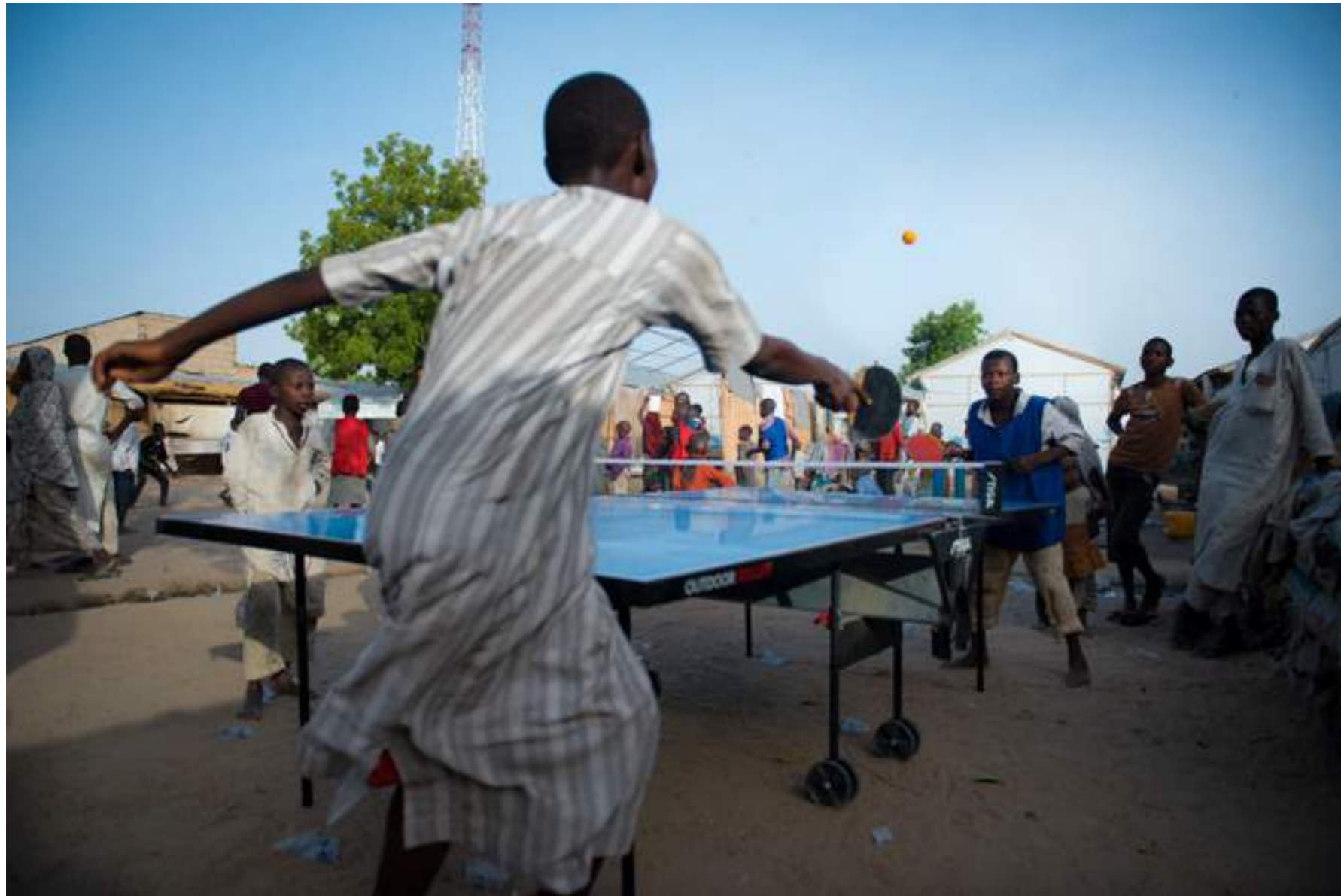
Building child-friendly spaces.

Boko Haram insurgency survivors receive psychosocial support under the EU Strengthening Community-Based Psychosocial Support and Protection Services for Children and Adolescents in Maiduguri, Borno State.