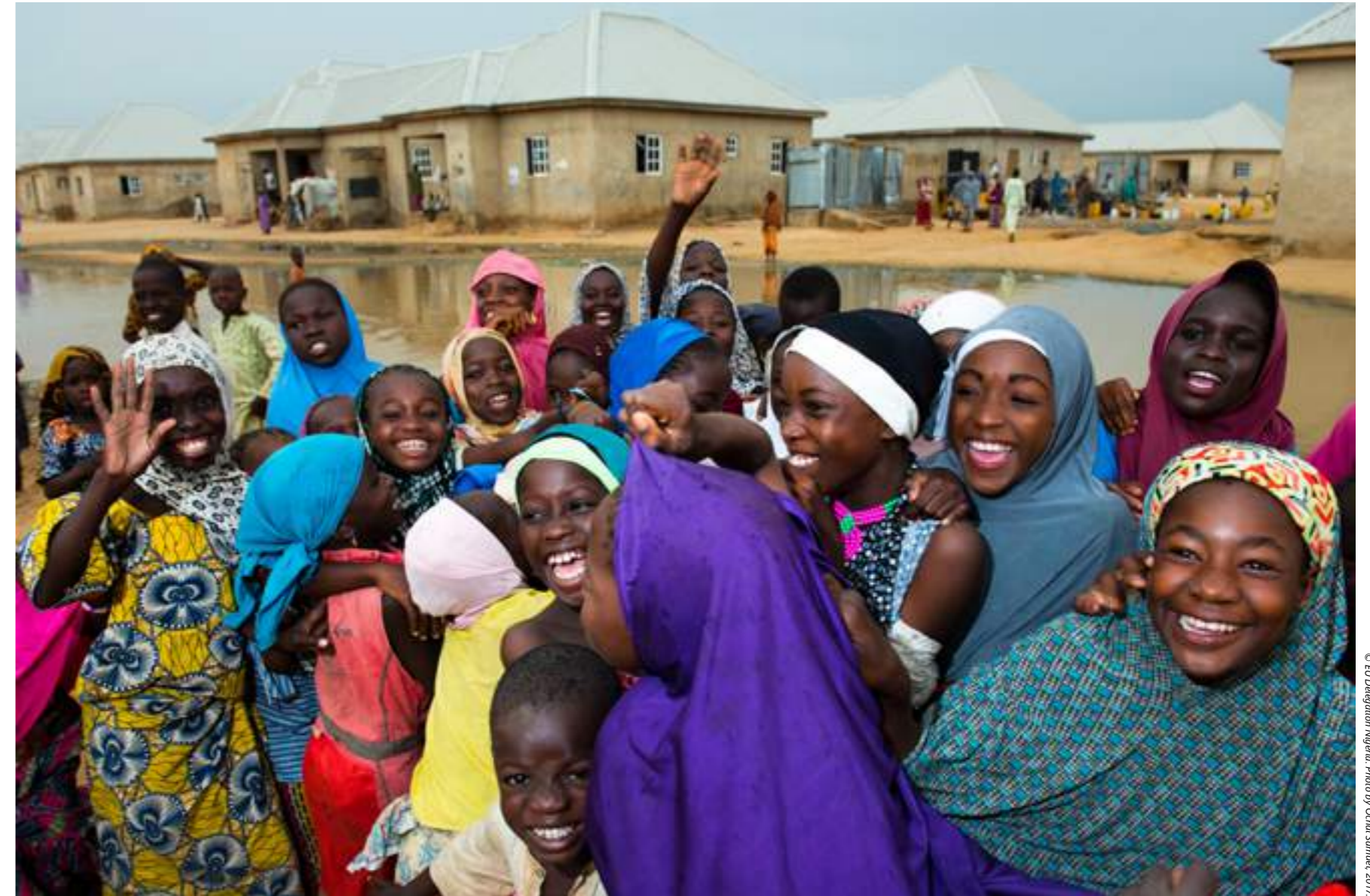
They've taken our parents but they can't take away our joy...

Boko Haram insurgency survivors receive psychosocial support under the EU Strengthening Community-Based Psychosocial Support and Protection Services for Children and Adolescents in Maiduguri, Borno State.