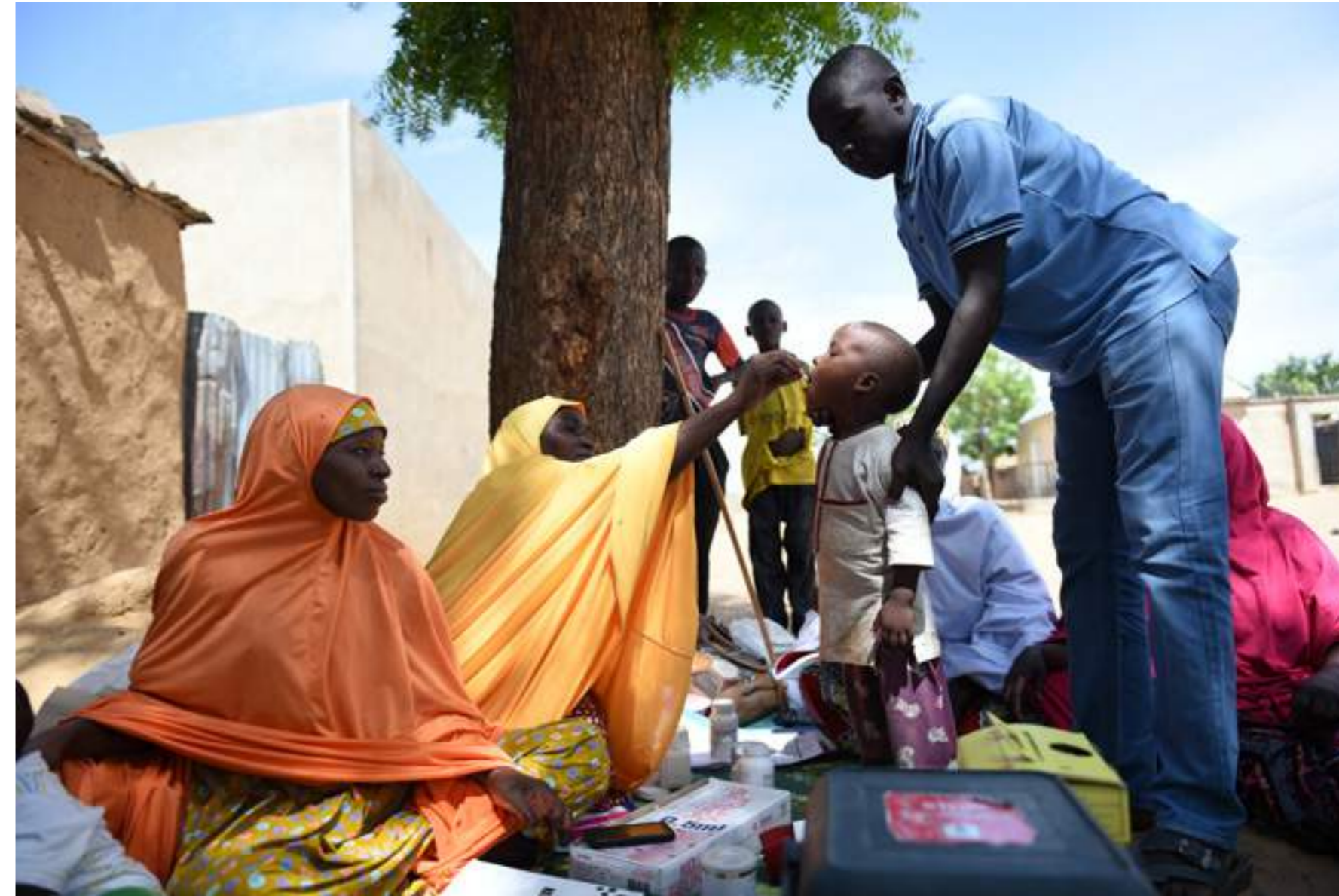
Reaching every district.

An EU-SIGN trained health worker documents the details of a child during a birth registration exercise in Nayinawa community PHC, Damaturu LGA, Yobe state.