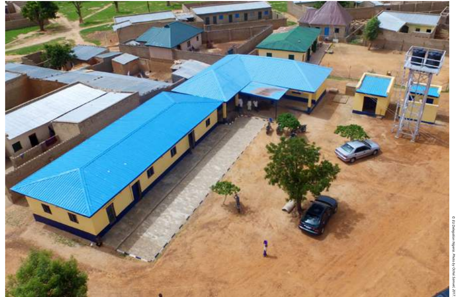
This cold store facility was renovated by the EU-SIGN project alongside provision of a generator house and an overhead tank in Jido community, Dawakin Kudu LGA, Kano state.

© EU Delegation Nigeria. Photo by Ochi Samuel, 2017.