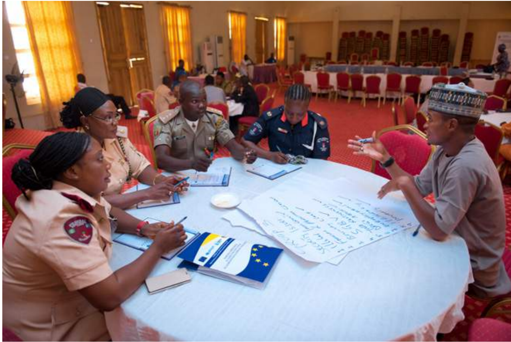
Security personnel brainstorm in groups at a 2 day workshop titled: Security Personnel on Reporting, Tracking and Monitoring of National Action Plan on UNSCR. The workshop took place in Gombe State and is funded by the EU in collaboration with UN WOMEN and the Federal Ministry of Women Affairs.