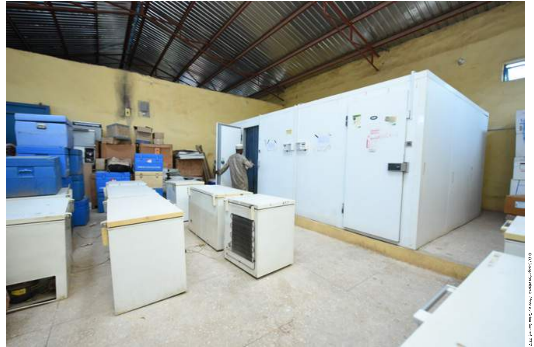
We ensure cold room facilities operate to global quality standards.

An EU-SIGN trained health worker vaccinates a child against measles at the Orphans and Less Privilege Clinic (OLPC) in Talata Mafara LGA, Zamfara State.