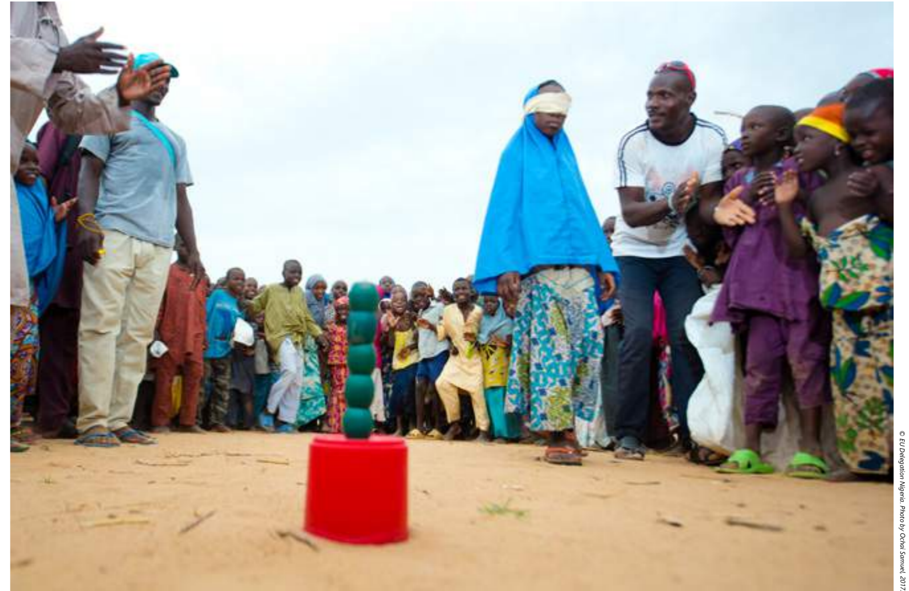
Seeing through sound. Experiential learning.

Studies show that exercise has helped cure or reduce the negative effects of children's mental disorders such as stress, depression, and attention deficit hyperactivity disorder.