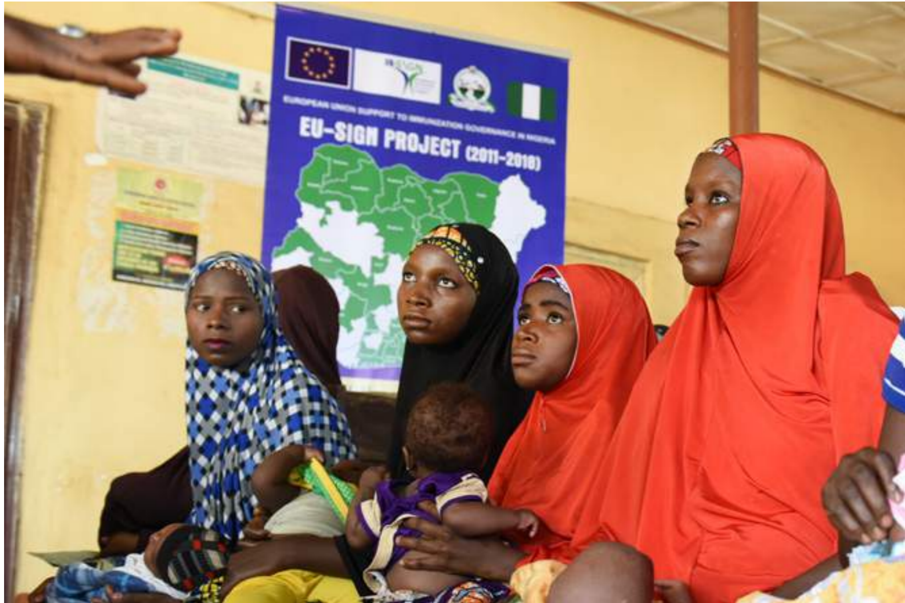
Cross section of Nursing mothers receive health talk from an EU-SIGN trained health worker on the importance of immunizing a child against vaccine preventable diseases talks in Gwange PHC facility, Damaturu LGA, Yobe State.