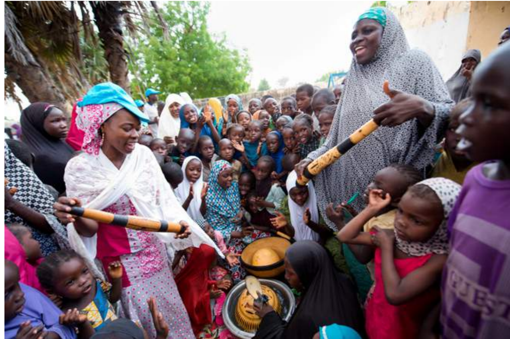
Survivors - The Children enjoying the music and games.