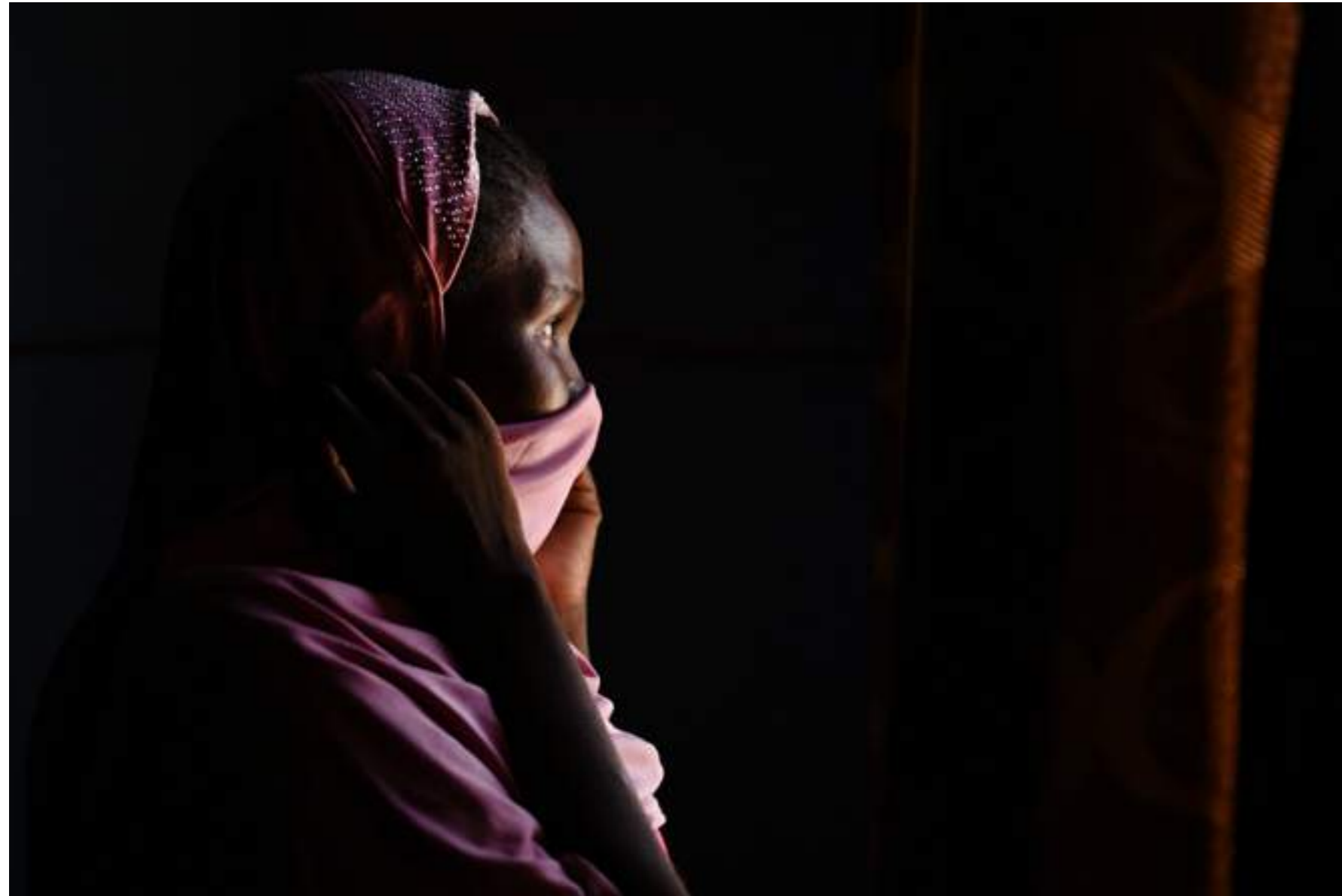
Looking forward with hope...

Boko Haram insurgency survivors receive psychosocial support under the EU Strengthening Community-Based Psychosocial Support and Protection Services for Children and Adolescents in Maiduguri, Borno State.