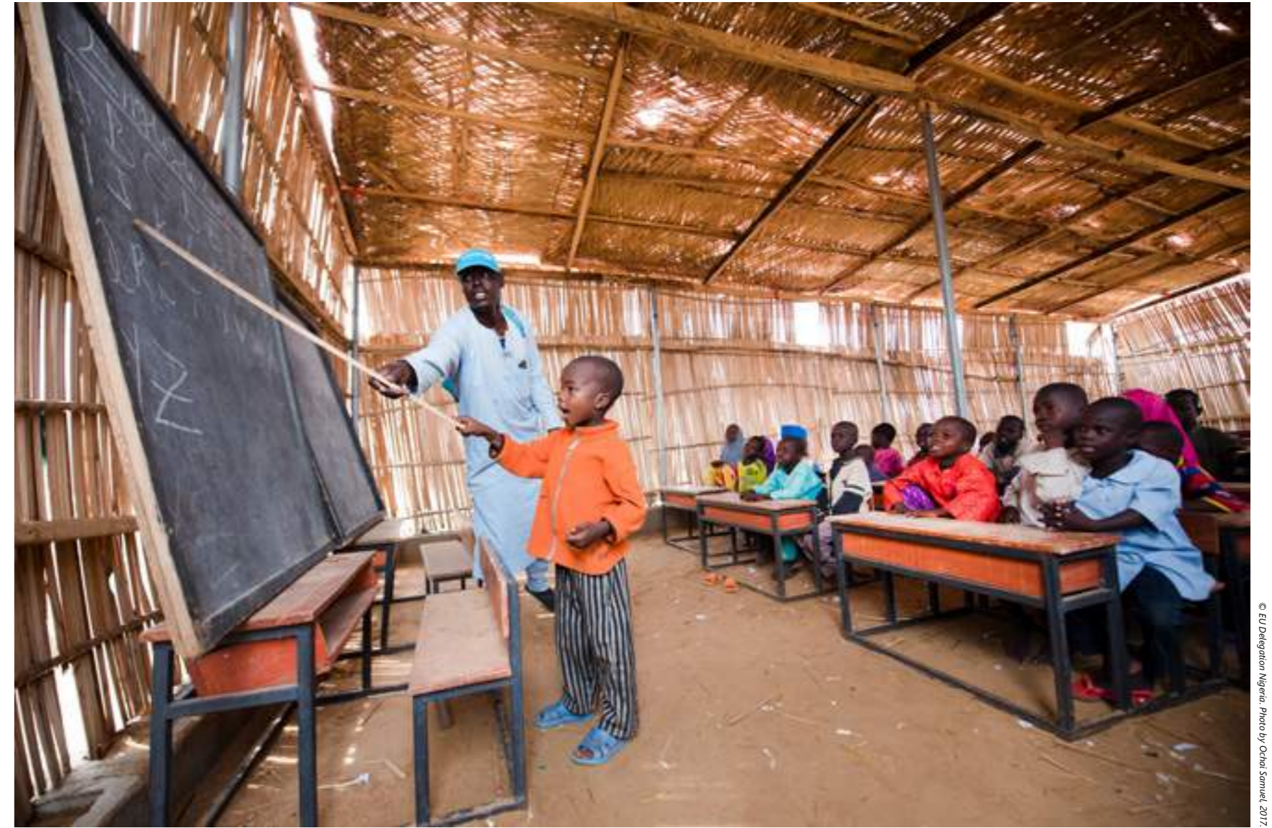
Education must continue – children learning the alphabet in an IDP Camp in Maiduguri, Borno State.