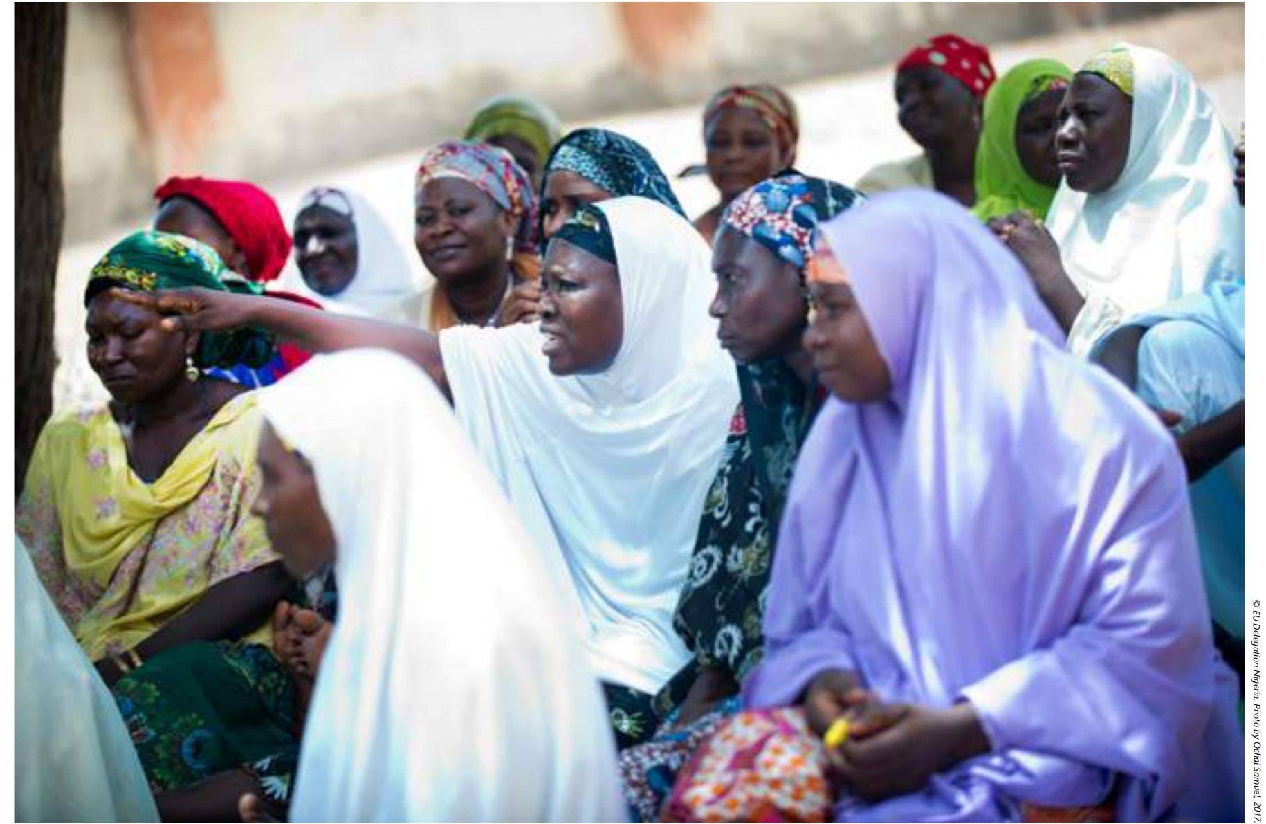
Grass root women from Balanga LGA, Gombe state, sit and listen attentively during an EU funded Women engagement in Peace and Security train the trainer program.