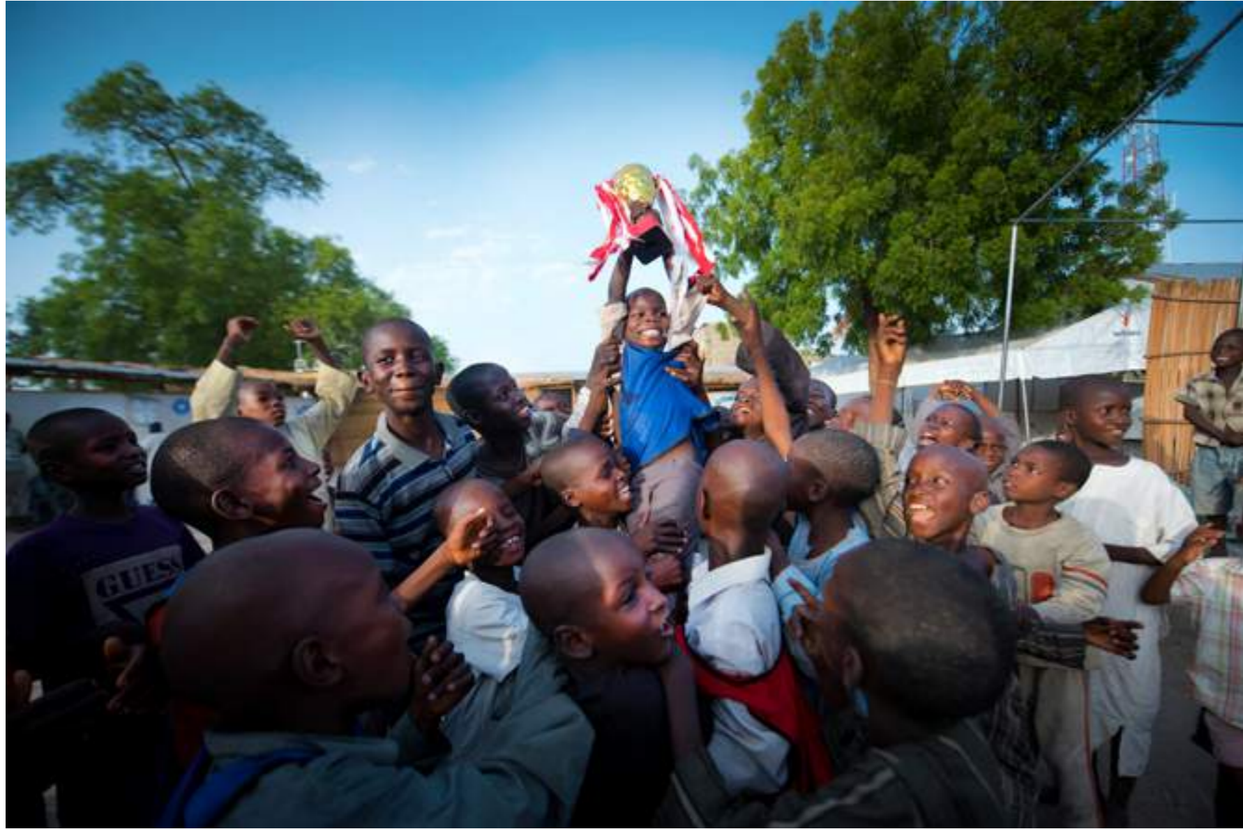
Team spirit - Celebrating life's wins.