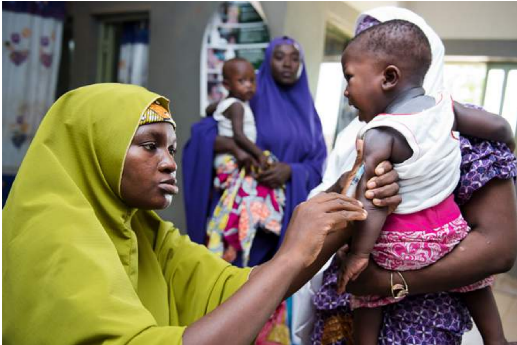
One moment of pain, a lifetime of gain.

An EU-SIGN trained health worker vaccinates a child against measles at the Orphans and Less Privilege Clinic (OLPC) in Talata Mafara LGA, Zamfara State.