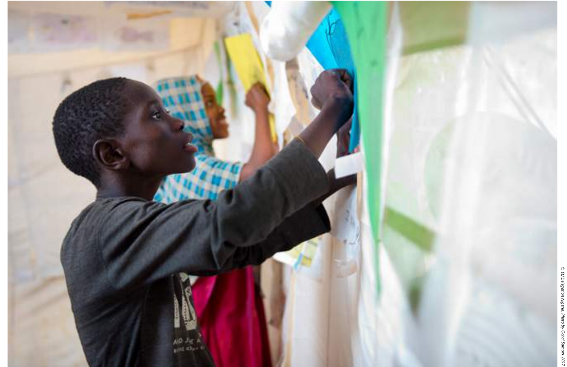
© EU Delegation Nigeria. Photo by Ochi Samuel, 2017.