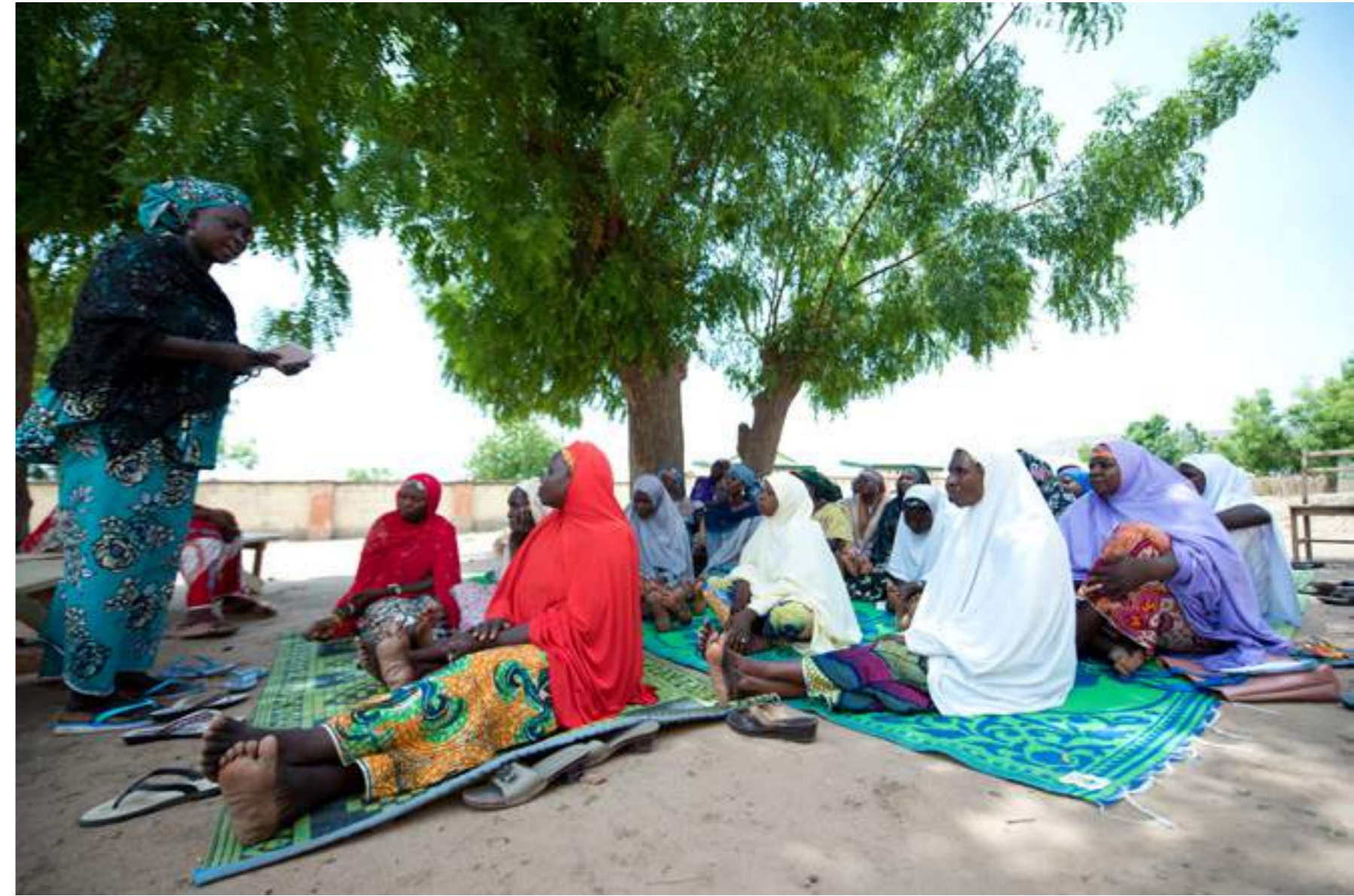
Laughter during a WPS training session under the Promoting Women's Engagement in Peace and Stability in Northern Nigeria project at Balanga LGA, Gombe State.