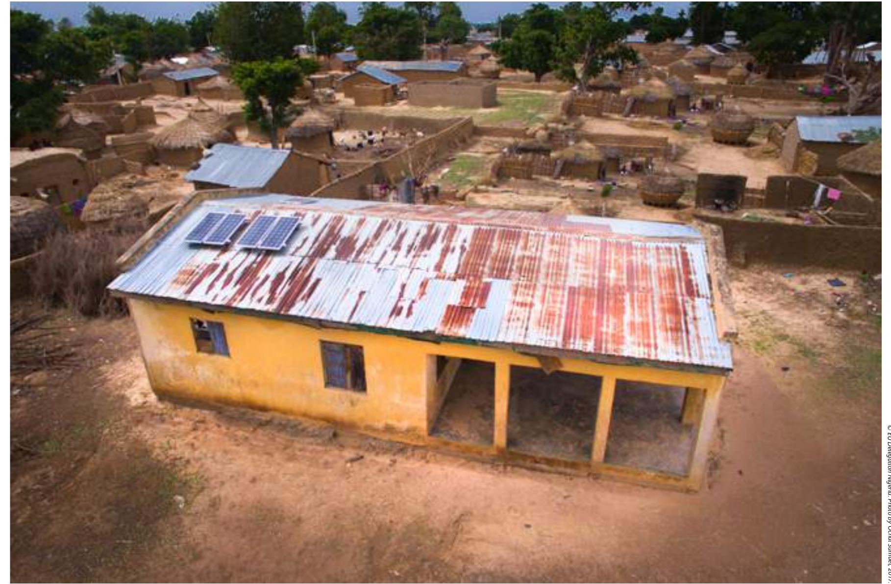
The refrigerator within this Cold Store building had been incapacitated due to incessant power outage until the intervention of the EU-SIGN project which funded the renovation of the building alongside purchase of batteries, charge controllers and Solar Panels to bring it back to its full optimal performance. The cold store is located at Shongom Local Government Area Gombe State.