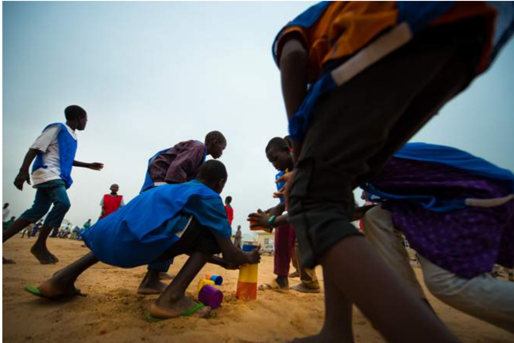
Adolescents learn team work in a team-building session.