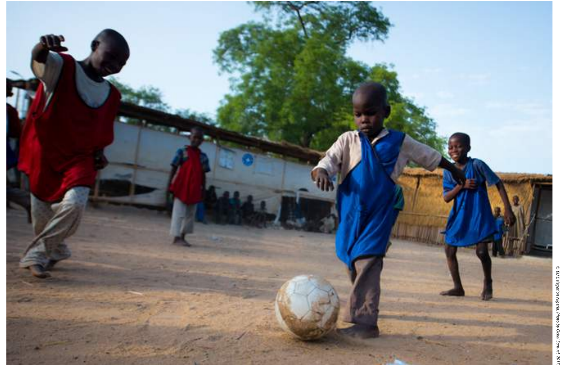
Play and Learn session day in one of the IDPs camps in Borno State, Maiduguri.

© EU Delegation Nigeria. Photo by Ochi Samuel, 2017.