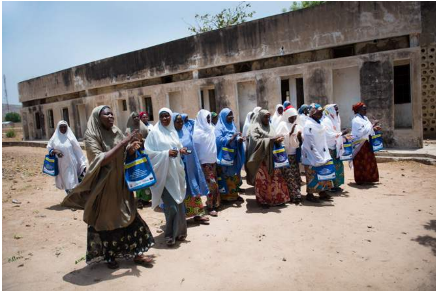
© EU Delegation Nigeria, Photo by Ochi Samuel, 2017.